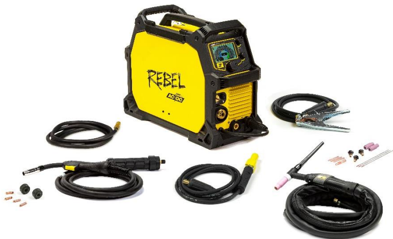
Rebel EMP 205ic AC/DC and accessories.