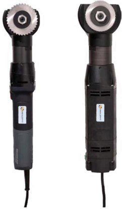
OTSM-1220 1300W standard