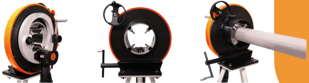
OTSM-2220 1500W optional

The OTS orbital pipe cutting machines are delivered in a wooden crate with a bottom fixation for transport and storage. The standard OTSM-1220 (1300W) saw motor with variable speed control comes in a separate plastic case, which fits inside the crate with the machine. A set of keys and an English manual are included.